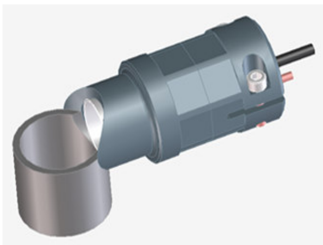
Connection for DN 40