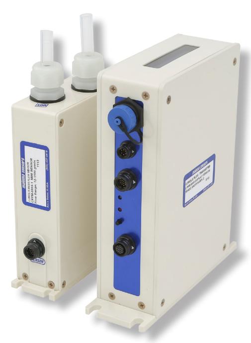
U.S. Patents 8404076, 8887578, & 9677921. Japanese Patent 5602884. Other patents pending.